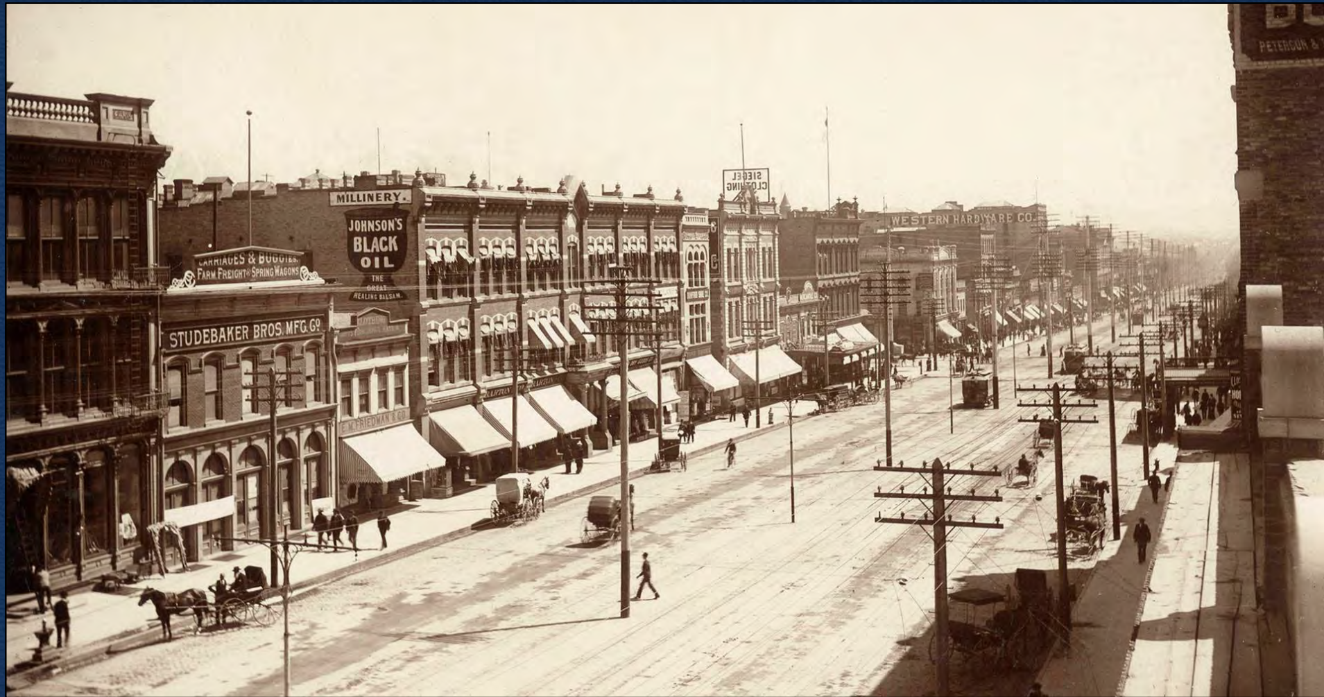
SALT LAKE CITY, UTAH; Main Street, undated; East Side East Temple St. [Main Street] Salt Lake City